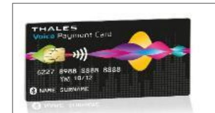
Voice Payment Card for blind and visually impaired people