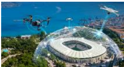
PARADE drone countermeasures system for large events