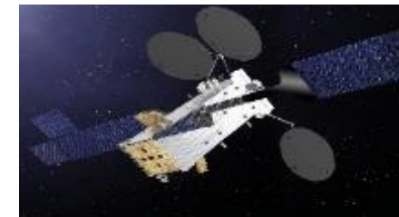
SATRIA satellite connecting 17,500 Indonesian islands