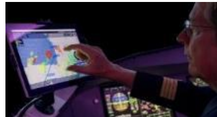
Purefly Flight Management System selected by Airbus