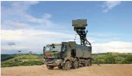
Air defence solutions for Ukraine

Supporting universal access to basic rights (right to a legal identity, access to digital technology)